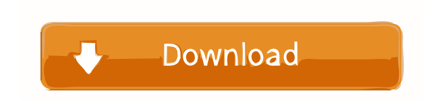
Tableau Desktop 2019.3.1 Crack Torrent Product Keys